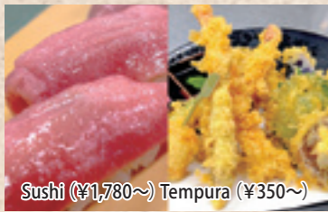
Sushi (¥1,780~) Tempura (¥350~)