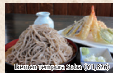
Ikemen Tempura Soba (¥1,826)