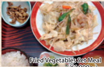
Fried Vegetables Set Meal (¥1,000~)