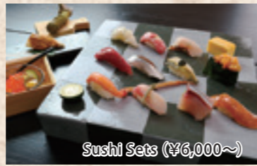
Sushi Sets (¥6,000~)