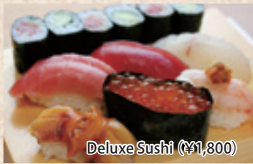
Deluxe Sushi (¥1,800)