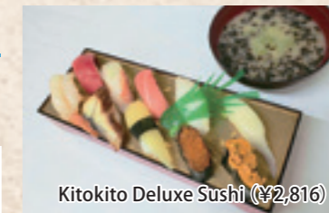
Kitokito Deluxe Sushi (¥2,816)