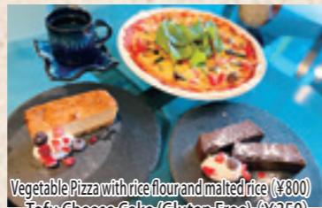
Vegetable Pizza with rice flour and malted rice (¥800) Tofu Cheese Cake (Gluten Free) (¥350)