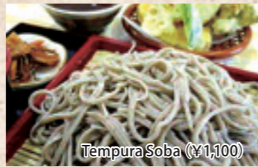
Tempura Soba (¥1,100)