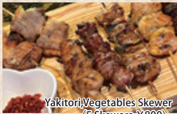
Yakitori, Vegetables Skewer (5 Skewers ¥800)