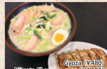
Gyoza (¥480) Niigata Chanpon-men (¥1,100)