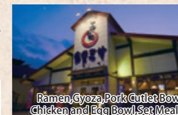
Ramen, Gyoza, Pork Cutlet Bowl, Chicken and Egg Bowl, Set Meals (Average size: ¥900~)