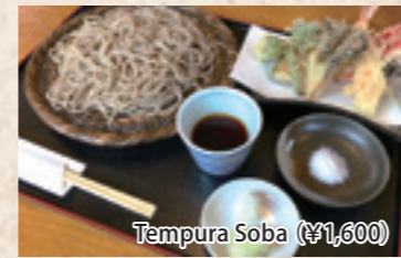
Tempura Soba (¥1,600)