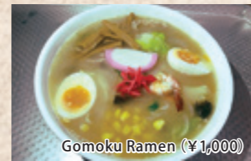
Gomoku Ramen (¥1,000)