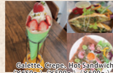
Galette, Crepe, Hot Sandwich (¥650~) (¥500~) (¥600~)