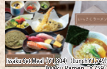
Issaku Set Meal (¥1,804) (Lunch ¥1,749) Issaku Ramen (¥759)