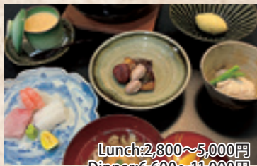
Lunch: 2,800~5,000円 Dinner: 6,600~11,000円