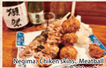
Negima, Chicken skins, Meatball (¥200each)