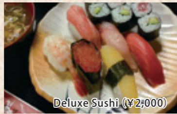
Deluxe Sushi (¥2,000)